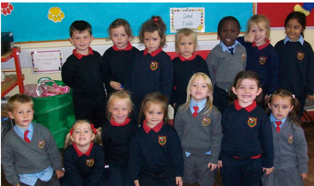
Junior Infants: Room 12