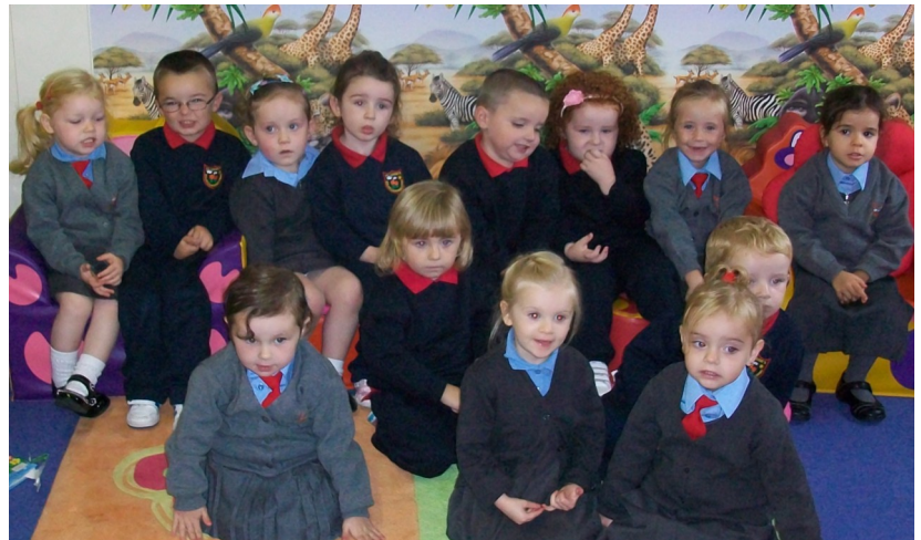
Early Start Morning Group

A millionbillion miles from home Waiting for the bell to go. (To go where?) Why are they all so big, other children? So noisy? So much at home they must have been born in uniform. Lived all their lives in playgrounds. Spent the years inventing games that don't let me in. Games that are rough and swallow you up.