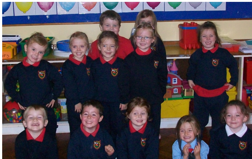
Junior Infants: Room 11