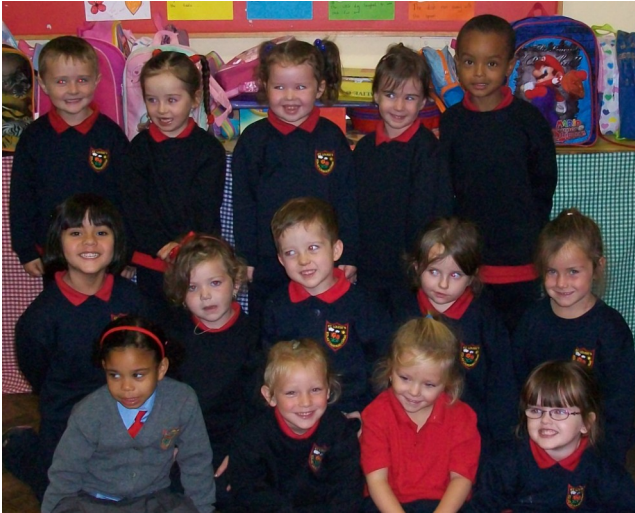
Junior Infants: Room 10

On the 1st of September the new Early Start pupils and Junior Infants began school for the first time. We hope they will be very happy in our school. We do have a limited number of places available in Junior Infants and in the afternoon Early Start if you know any one who requires a place.