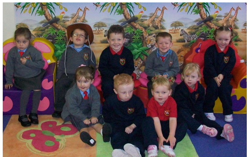
Early Start Afternoon Group

And the railings. All around, the railings. Are they to keep out wolves and mon- sters? Things that carry off and eat children? Things you don't take sweets from? Perhaps they're to stop us getting out. Running away from the lessins. Lessin. What does a lessin look like? They keep them in classrooms. Whole rooms made out of glass. Imagine. Roger McGough